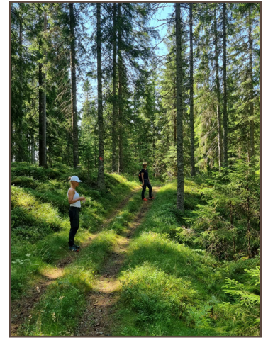
Carriage road south to Tobyn.