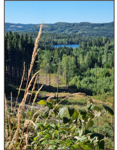
View from northwest of Röstorp.

From the Tobyn junction you go west on the gravel road. There might be some local traffic. Where the road splits you take a left and reach the parking at Storperstorpet.