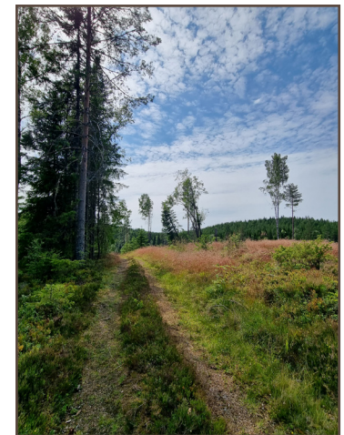
Carriage road south to Tobyn.