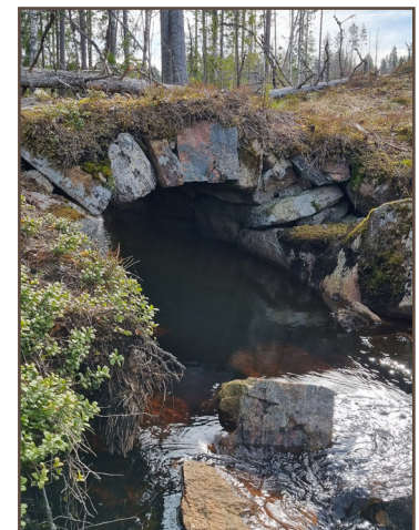
Stone bridge at Fågeltjärnet.