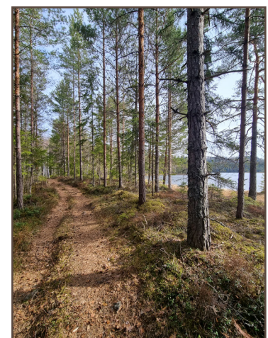
Pine needle covered path at Fågeltjärnet.