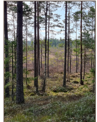
The mire Slobymossen.

After a small hill, duck-boards take you cross a tiny creek. There is a cutting area as you climb uphill past the old farm Röstorp.