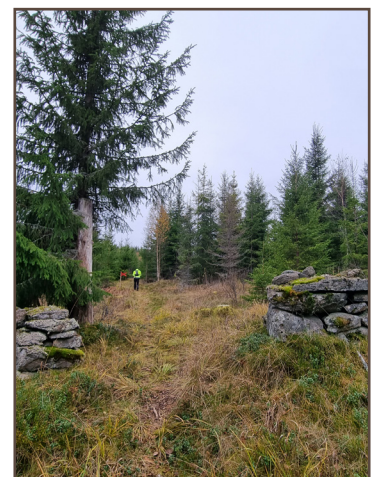
Croft remains at Fågelkullen, 100 m north of the trail.