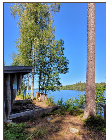
Wind shelter on the west side of Lake Gränsjön.