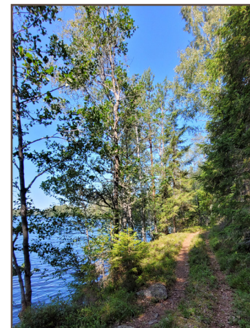
Part of the trail on the eastern shore of Lake Gränsjön.