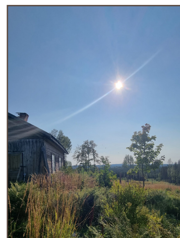
Övre Lafallhöjden, west of Lafallhöjden.