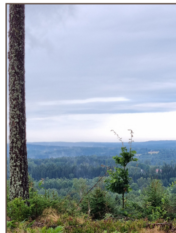
View from Bräckeberget, heading up to Ryggestaberget.

Coniferous forest surrounds the trail to the old croft Södra Höjden. In rainy periods it can be partly wet here, but nothing a good set of boots cannot handle. Soon you cross the creek Järperudsälven on a wooden walking bridge. The path crosses