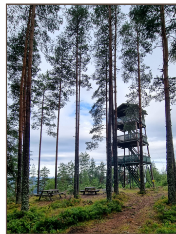
The Ryggestaberget view tower and rest area at 192 masl.