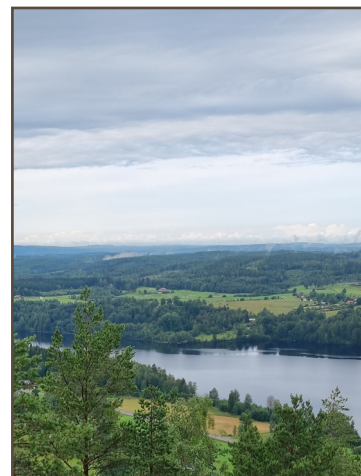
View from the tower towards south west, over Lake Bergsjön.