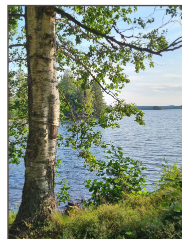
Rest area at Lake Stor-Treen, about 100 m off the trail.