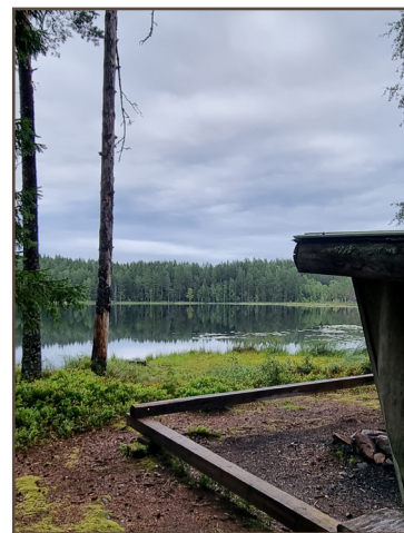
At Mörttjärn the trails Norra and Södra take different directions.

A pleasant walk of about 1,5 km through pine and heather takes you to a timber road, leading back to the starting point of the circular trail after 900 meters.