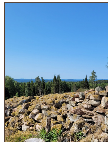
Stone built enclosure at Solbergliden, north of Gränsjön.