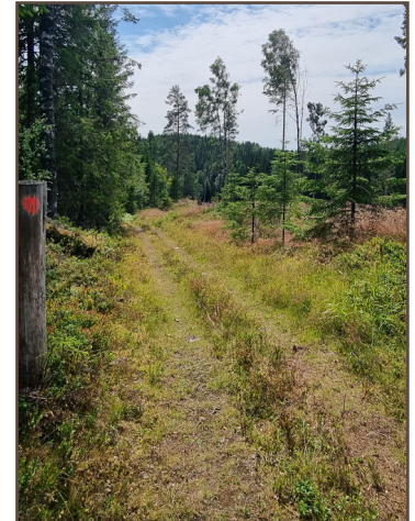
Easy walk on carriage roads.

The trail can also be used as a combination with surrounding trails.