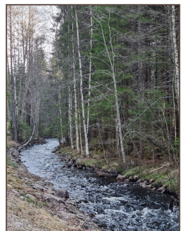
The creek Tobyälven along road 878.