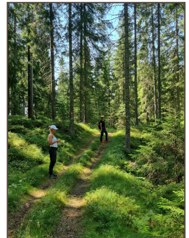
An easy walk on carriage roads.