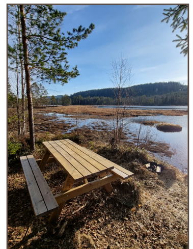
Bench table at Nedre Flytjärnen along road 878.