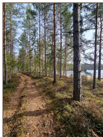
Coniferous path along Fågeltjärnet.