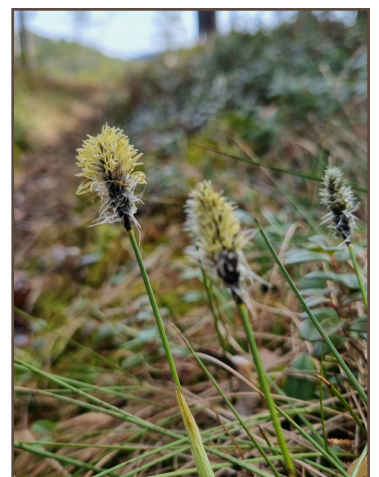
Cotton grass blooming in May.