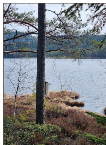
Nesting house at Fågeltjärnet.