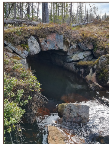
Stone bridge close to Fågeltjärnet.

The path makes a bend south and then east uphill. Heading north again you reach Fågelkullen. Here are the remains of two crofts and stone walls about 40 meters north, slightly off the trail. A south and east bend again takes you to the timber road where the three Finn trails meet.