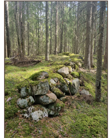
Stone built enclosure at Porna.