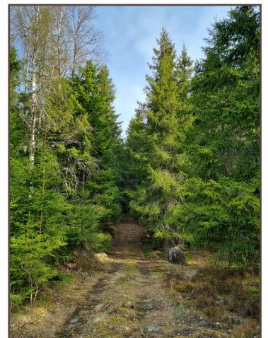
Carriage road through spruce forest.