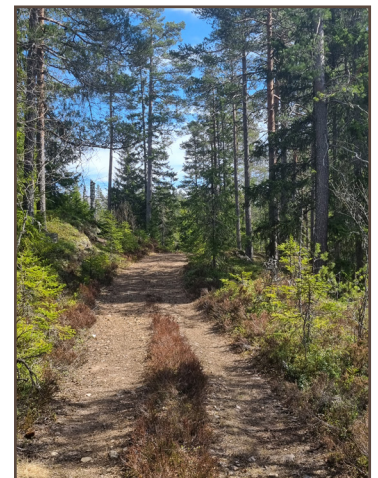
Heather and pine along the peatland Pornamossen.