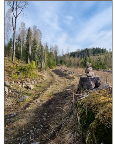
Slight uphill, southern stage.

Mangskog Local Heritage Centre Neragata, WGS84: 59.753906, 12.799520. Here is a spacious parking lot. To access the trail, follow the asphalt road north for 1,2 km and turn east onto the gravel road through the residential area. The trail starts at the end of the gravel road where there unfortunately is no parking space, which is the reason for the extra walk from the heritage centre.