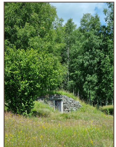
Root cellar at Lafallhöjden.