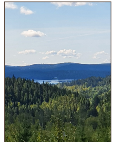
View over Treen from Lövhöjden.