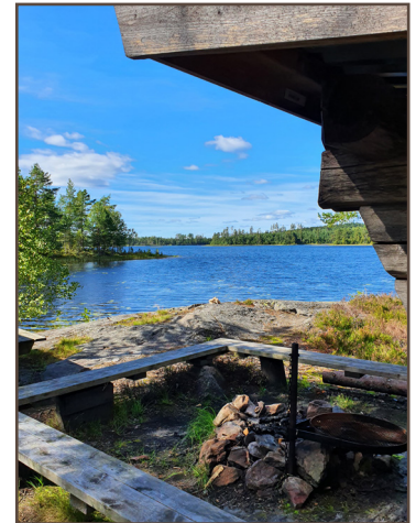
Wind shelter at Ämten, 300 m off the trail.