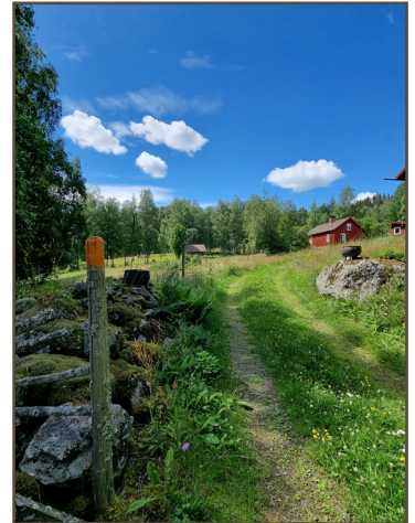
The Lafallhöjden Finn croft.