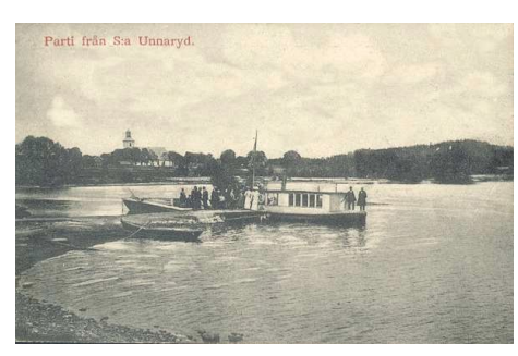
The steamboat Vega arrives at Alebo

A large lake, Lake Fjällen, is located west of Unnaryd. This lake is fed with water through a small stream, Fjällabäcken, originating from a smaller lake called Sjättesjö. Sjättesjö is not far from Unnaryd, but still its surface is more than 20 metres higher than Lake Unnen. Sjättesjö