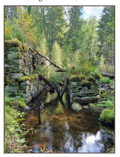
Remains of a mill at Övre Bruket, north trail.