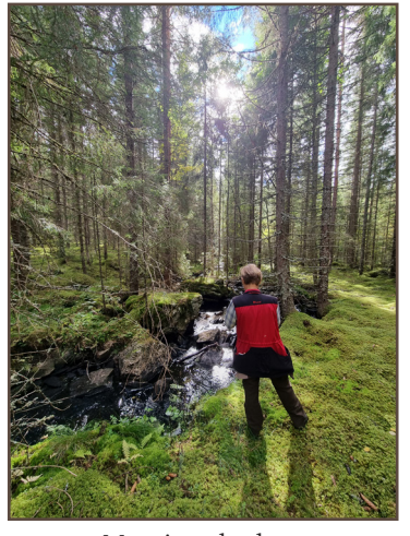
Mörttjärnsbäcken, north trail.