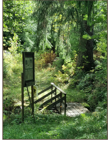
Walkway across the old timber flume at Övre Bruket.