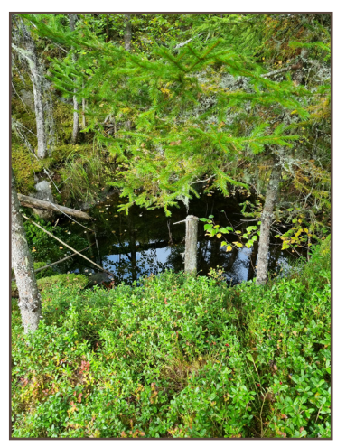
The largest of the three pits at Mörttjärnsgruvan.