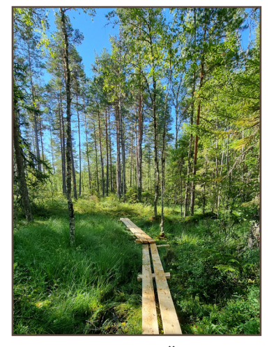
Duck board between Övre Bruket and Gruvrundan, north trail.