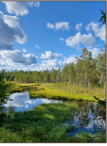
Bruksälven, where timber was floated, beg. of 20th c., south trail.

From Gruvrundan you head west, then north west, along a flat, grassy carriage road, to hit a path after 700 meter. The path follows a ridge through mixed forest. After I km you exit onto a gravel road, but take off again to a path after only 100 m. Here is where you choose either the south or north way to Fredros.